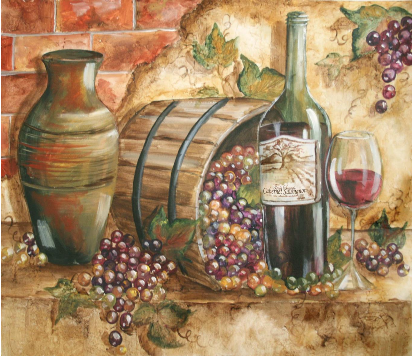
A Promise Vintage