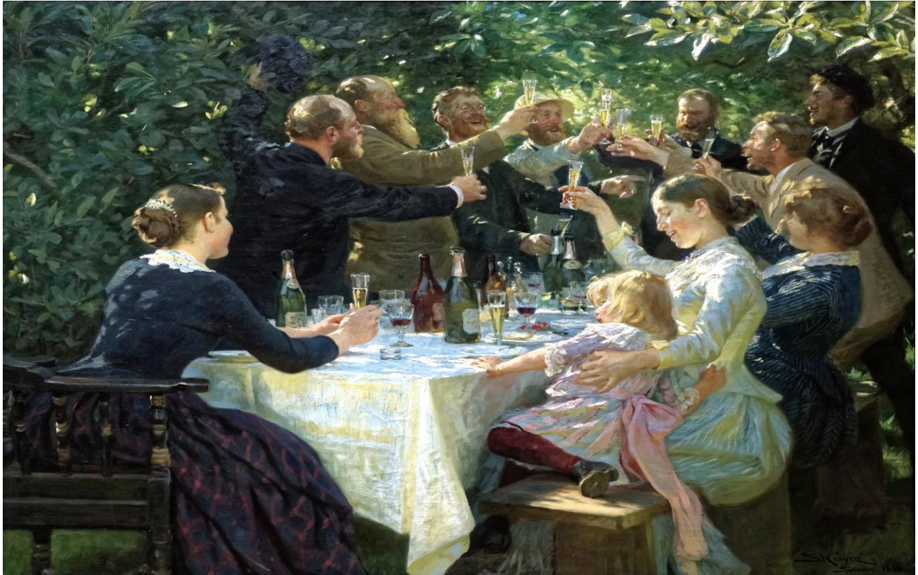
Hip Hip Hurrah ! Artist's Party, Skagen

Clearly not just the physical effect of the alcohol lurking behind the bubbles. In most circumstances even the sound of a cork popping lightens the mood and provokes an immediate sense of expectation. With a flute of Champagne in hand, the young feel wisely witty, the old feel young and everything is better looking.