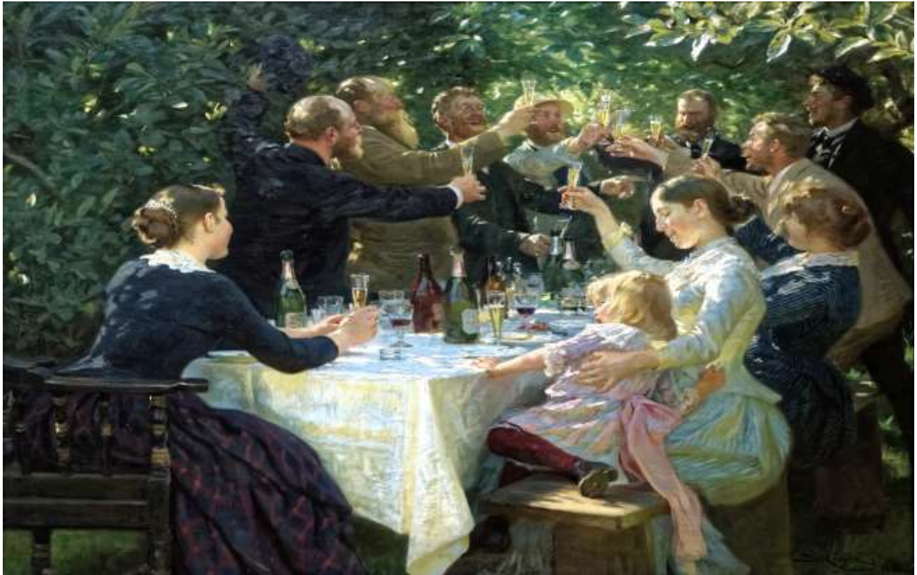
Hip Hip Hurrah ! Artist's Party, Skagen

Clearly not just the physical effect of the alcohol lurking behind the bubbles. In most circumstances even the sound of a cork popping lightens the mood and provokes an immediate sense of expectation. With a flute of Champagne in hand, the young feel wisely witty, the old feel young and everything is better looking.